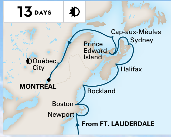
THE ATLANTIC COAST FT. LAUDERDALE TO MONTRÉAL Volendam Apr 21