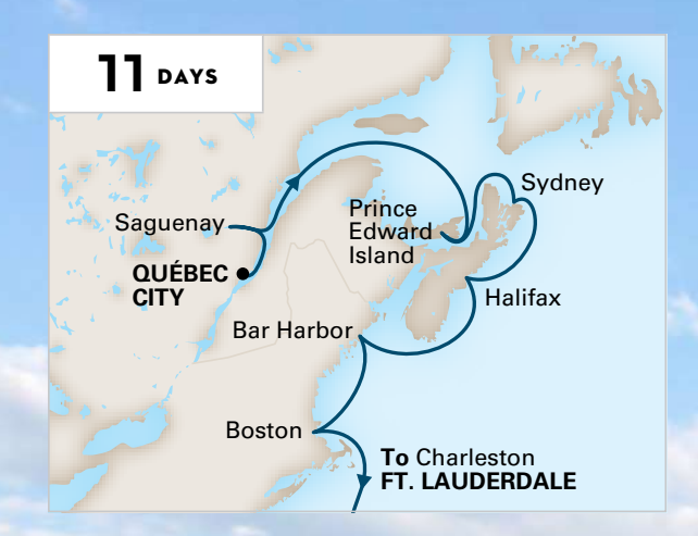
THE ATLANTIC COAST QUÉBEC CITY TO FT. LAUDERDALE Zuiderdam

Our flexible itineraries either depart from or arrive in Fort Lauderdale, allowing you to combine your Canada & New England vacation with a cruise along the beautiful Atlantic Coast. Drive along Cape Breton's scenic Cabot Trail and visit some of New England's most iconic cities, including Bar Harbor and Boston. Relax while taking in coastal views from your private verandah and keeping watch for whales and dolphins in the waters below. However you choose to cruise, these Atlantic Coast sailings are sure to offer just what you're looking for.