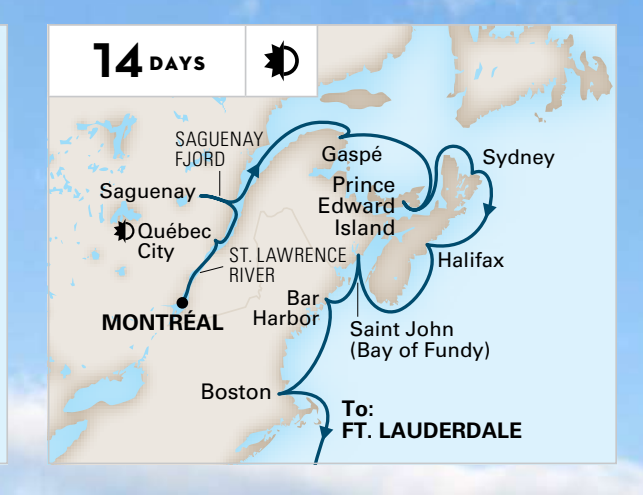
THE ATLANTIC COAST MONTRÉAL TO FT. LAUDERDALE Volendam Oct 5